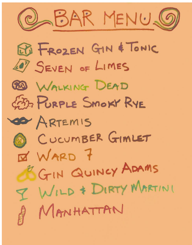
BAR MENU, FROM DAVEY'S 60TH BIRTHDAY PARTY

Please note: some items can be stored safely on your bar shelf, but others need to be refrigerated.